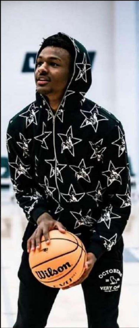
BRONNY IN OUR HOODIE