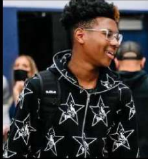
BRYCE in our Hoodie

"When it comes to style and comfort, even celebrities can't resist our hoodies."